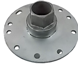
Style B Top